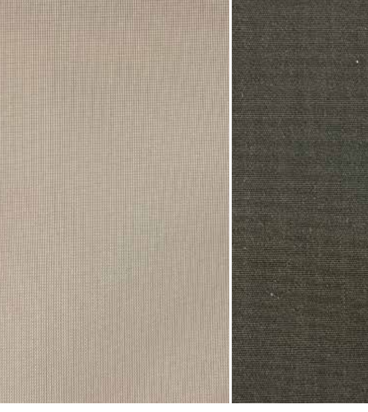
1 | VOUGE EUCALYPTUS